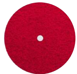
TK RED Buffing Pads