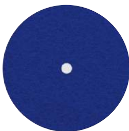
TK BLUE Polishing Pads