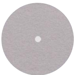
TK WHITE Polishing Pads