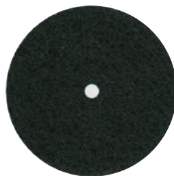
TK GREEN Scrubbing Pads