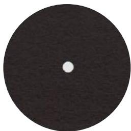
TK BLACK Stripping Pads